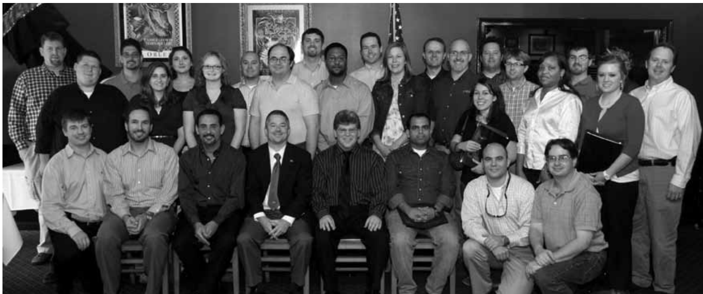
New Licensees and Certificate holders present at the LES Licensing Ceremony February 2011.